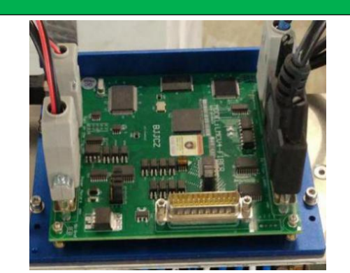
JCZ EZCAD marking control card