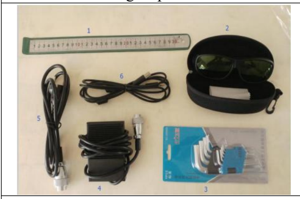
Accessory to help good working