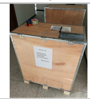
Export Standard Wooden case packing