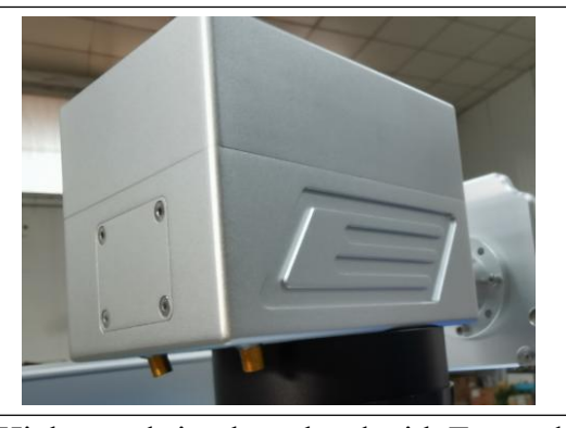
High speed sino laser head with Two red lights point