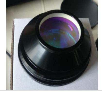
F-theta lens(Wavelength Opto-Electronic(S) Pte.,Ltd)