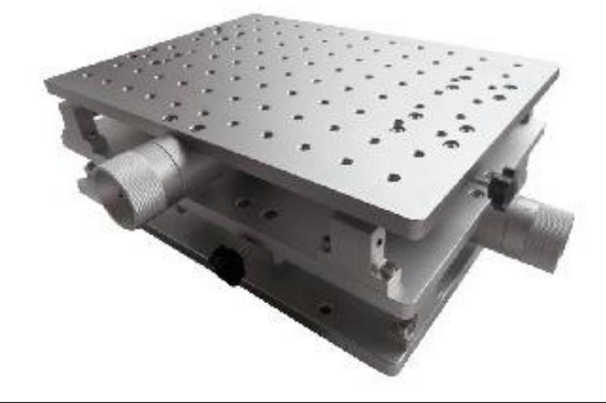
2D working table