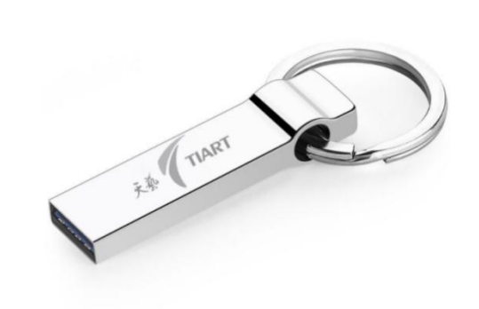
USB driver to backup software & setting